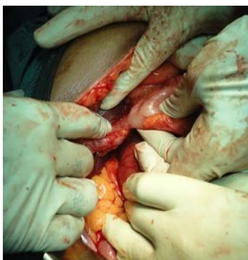
Fig 2: Tumour arising from the posterior wall of stomach infiltrating into the tail of pancreas