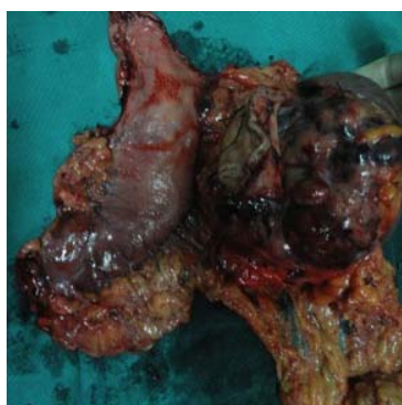
Fig 4: Specimen of subtotal gastrectomy with tumor, tail of pancreas and spleen

The postoperative period was uneventful. The Histopathological examination of the specimen revealed the lesion from stomach to be a high-grade Malignant Gastrointestinal Stromal Tumour which was CD 117 – positive. The Gall bladder had an INFILTRATING ADENOCARCINOMA – MODERATELY DIFFERENTIATED. The patient was discussed in the tumor board again and it was decided to start adjuvant chemotherapy with 5-FU. Patient had completed