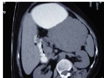
Fig 1: CECT Abdomen showing a large exophytic lesion arising from the stomach

were normal. She was a Known diabetic and hypertensive on treatment. She had no h/o surgeries in the past. On examination, her general condition was fair with a karnofsky performance status of 90%. She had no pallor / icterus / pedal edema. Her abdomen was soft with no palpable mass or organomegaly. Per rectal examination revealed no deposits. Routine investigations including CBC, RFT and LFT were within normal limits. Stool occult blood was negative. An upper GI endoscopy was done which was also normal. USG abdomen and pelvis revealed a large heteroechoic mass of size 11*9 cm in the region of tail of pancreas - ?