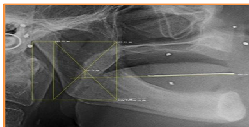
Fig.3: Lateral Cephalogram With Occlusal Plane Established By Method B

In method B[Fig.3], anteriorly occlusal plane of lower occlusal rim is established by considering the intra oral landmark 8,12,29 commissure of the mouth, and posteriorly upper third of Retromolar pad. Later maxillary occlusal rim is adjusted according to plane of lower occlusal rim at established vertical dimension of occlusion.