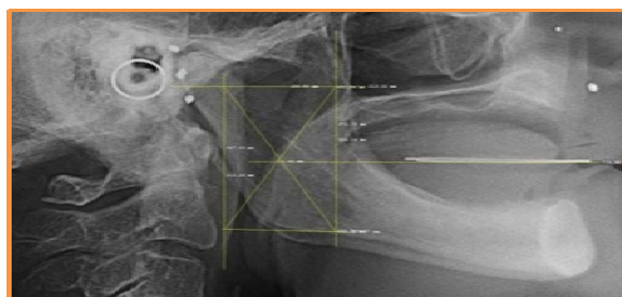
Fig.2: Lateral Cephalogram With Occlusal Plane Established By Method A

During jaw relation recording, occlusal plane is established by two different methods. In method A, anteriorly occlusal plane of maxillary occlusal rim is established by considering the esthetics 16 i.e 2mm visibility while speaking and posteriorly by considering the superior border of the tragus and lower border of the ala of the nose as reference plane 10,48 [Fig.2].